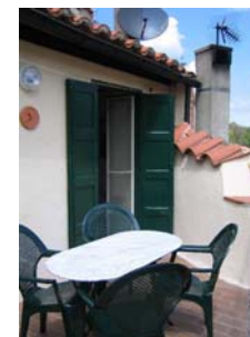
Terrace accessible from both upper bedrooms

You will find our rental rates vary throughout the season but start at 250 pounds per week. This is a fully inclusive price and there are no extra charges to pay for utilities, bedding, towels or taxes.