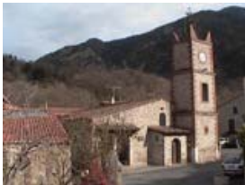
Clara's small but perfectly proportioned Church

as the location means you are never very far from where you want to be.