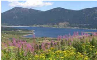
Lake Matemale in the Summer

This Chalet is ideally located within the old village giving ready access to shops and restaurants. It also benefits from spectacular views over Lake Matemale from the full width balcony. The interior is spacious and is ideal for the family group having two bedrooms and a mezzanine bedroom. Unusually for a property in the resort, the kitchen is full-size which again gives weight to the suitability for a family group.