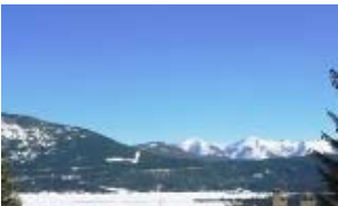
View from Balcony over Lac Matemale

The full-size kitchen is fully equipped with combination micro/convection oven, hob, toaster,